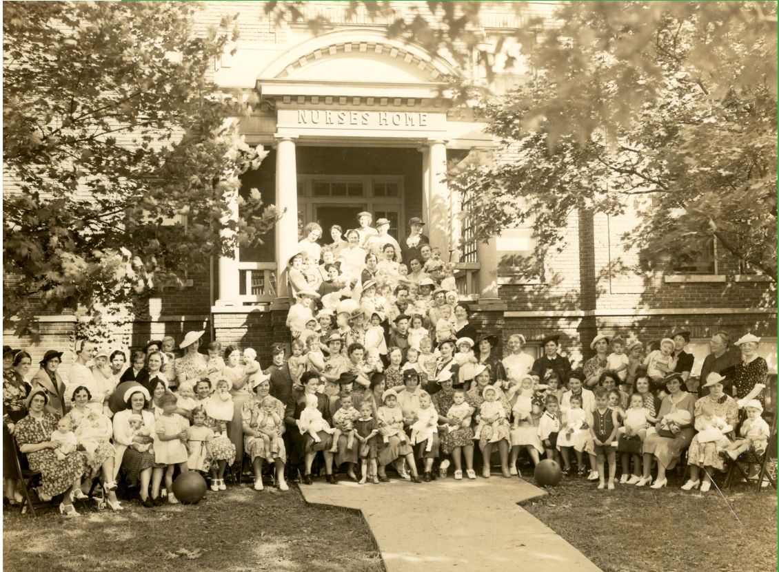
Caring for our community over the years: Mothers and babies born at Huntington Community Hospital gather for a reunion in 1937.